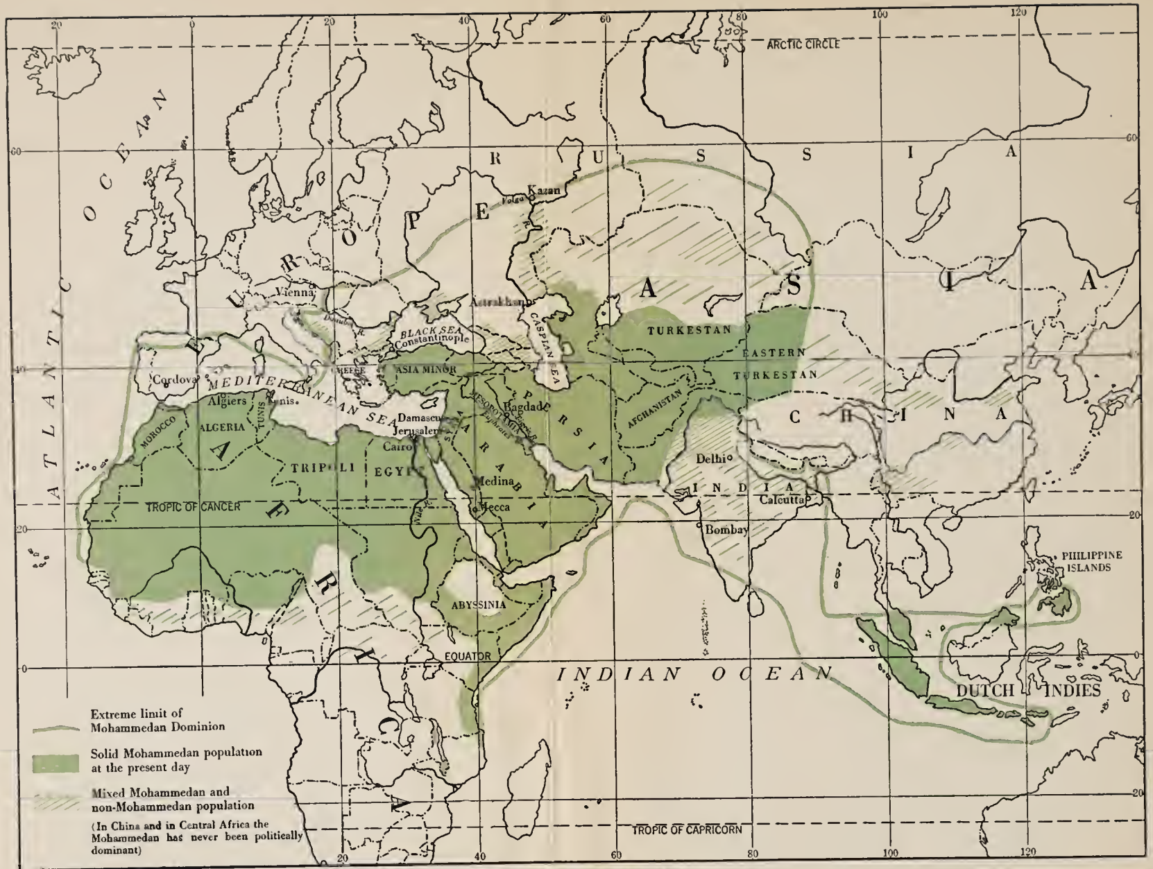
THE WORLD OF ISLAM.